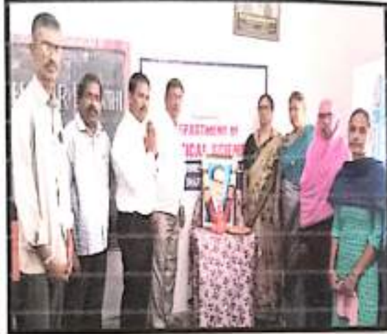
Principal, staff and the students paying tributes by garlanding the portrait of Baba Saheb Ambedhkar